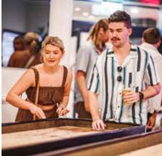
SOUTH LAWN INSIDE