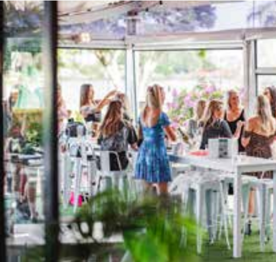
SOUTH LAWN ALFRESCO