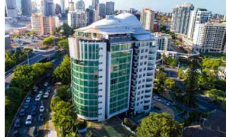
The Point Hotel